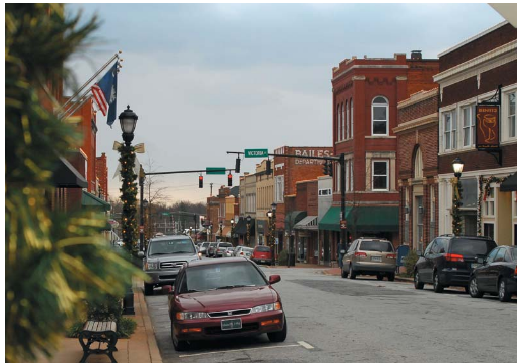
Business owners in hip, historic Greer Station may take advantage of the Greer Development Corp's business retention program, which has helped downtown thrive despite a struggling national economy.