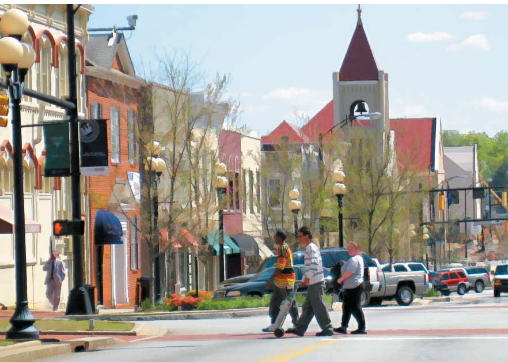
Anderson's downtown is listed on the National Register of Historic Places.