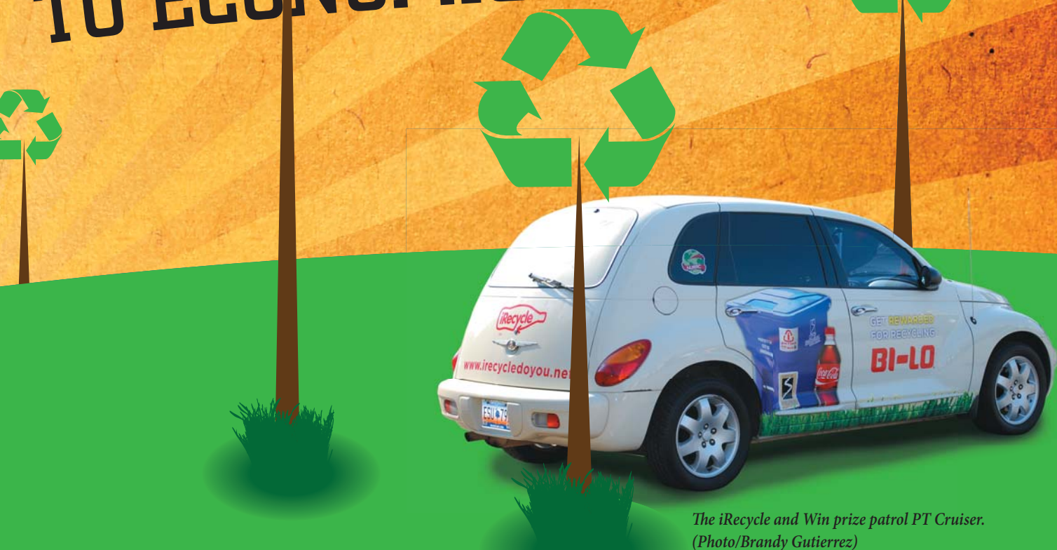
The iRecycle and Win prize patrol PT Cruiser.

A 2006 study conducted by the College of Charleston's Department of Economics and Finance showed that the recycling industry has a $6.5 billion impact on the South Carolina economy and provides more than 37,000 jobs to South Carolina residents.