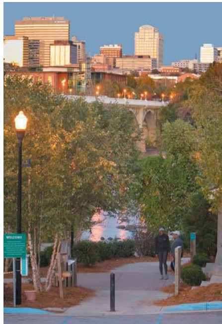
Riverwalk Park in West Columbia.

"For tourism to impact the state and local economies," suggests Prosser, "the effort must happen at the municipal level — passing ordi-