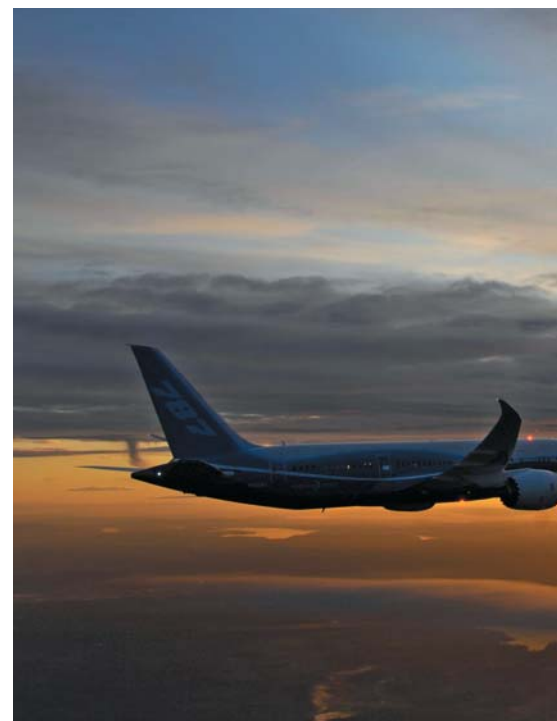
City and county leaders worked together to bring the Boeing Co. to North Charleston.

One new approach to economic development is through the formation of “clusters.”