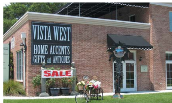
Top: Bright red rockers outside Interstate 95 Antiques in Walterboro. Middle: Sidewalk sale in downtown Elloree. Bottom: Antique district in West Columbia